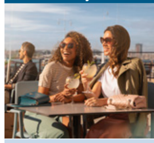
Over 30 restaurants, bars and coffee shops offering a range of menu options, many with waterside views.